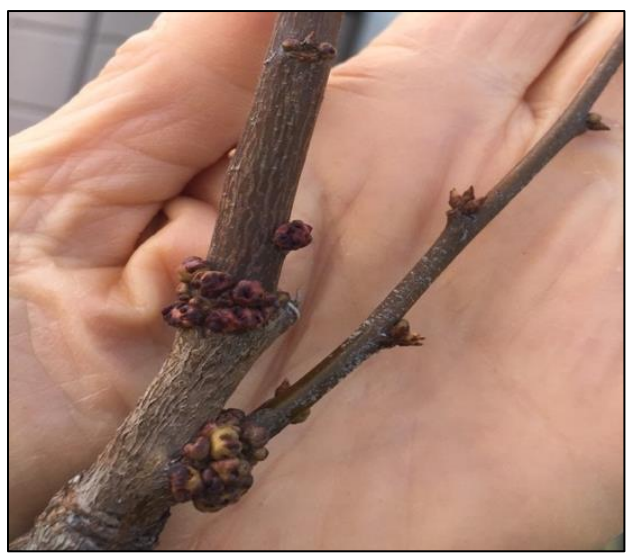
Fig. 1. Infected bud galls in a Flavor Queen Pluot tree.

Plum bud gall mites are primarily dispersed by wind, but can also be transmitted to new host trees by insects and birds, and by moving infected budwood.