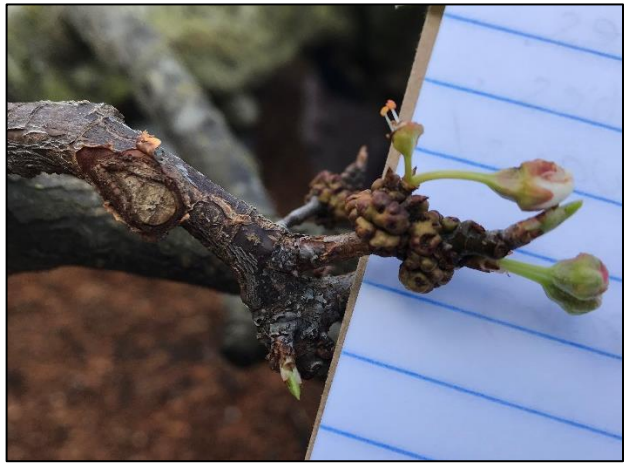
Fig. 4. Flavor Queen Pluot tree with infested bud galls.

peach trees (Fig. 3). Mites may also lead to the deformation of fruit spurs (Fig. 4).